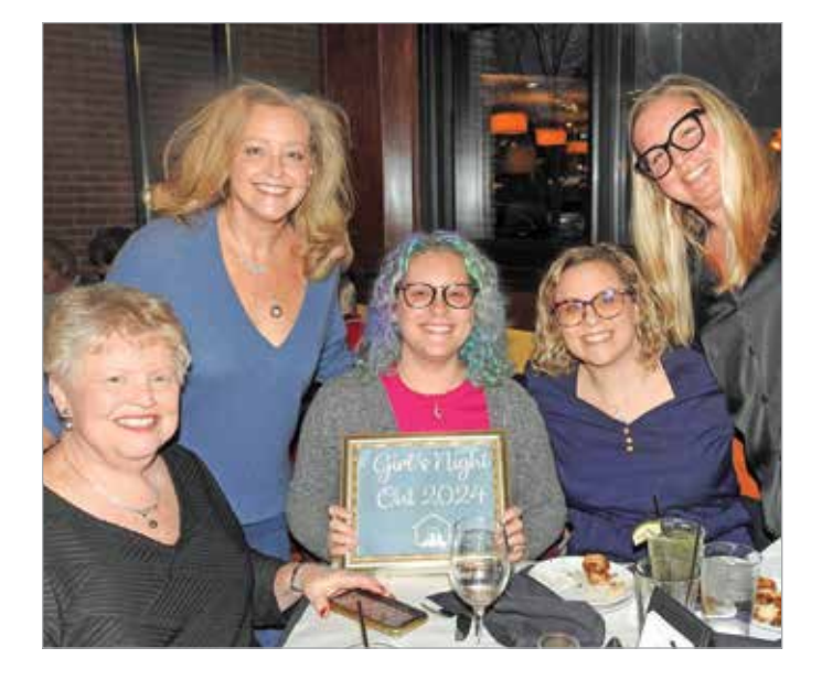
Our Girl's Night Out event brought out 75 guests at Clara's in Woodridge.

To get involved with our fundraising events, or host an event at your place of business, contact our events coordinator at events@wshs-dg.org.