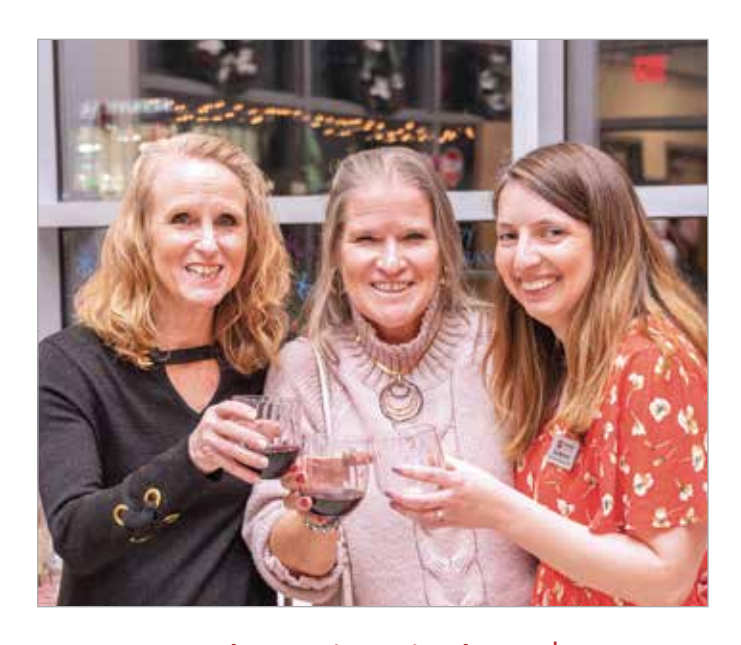
Our annual Pawction raised over $30,000 for our cats and dogs.