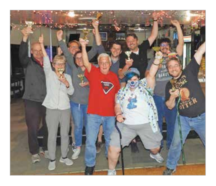
More than 150 contestants joined us for this year's Trivia Night at the American Legion.