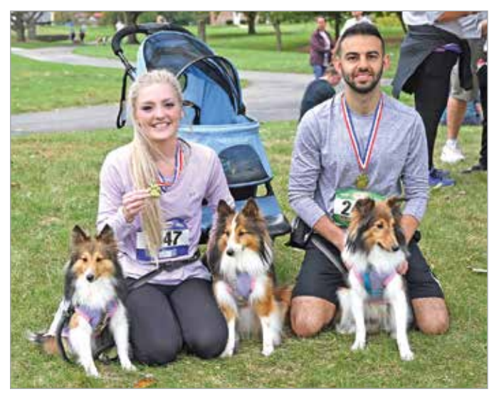
Awards were presented for the top overall 5K finishers, and the top finishers by age group.