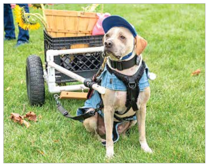
We had fun contests including dog and owner lookalike challenge and a costume contest.