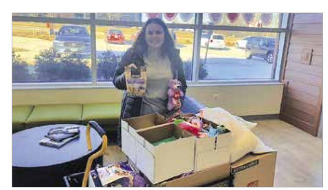
Fairmont Elementary School

The student council at Whittier School in Downers Grove held a donation drive. They donated tons of food, toys and supplies.