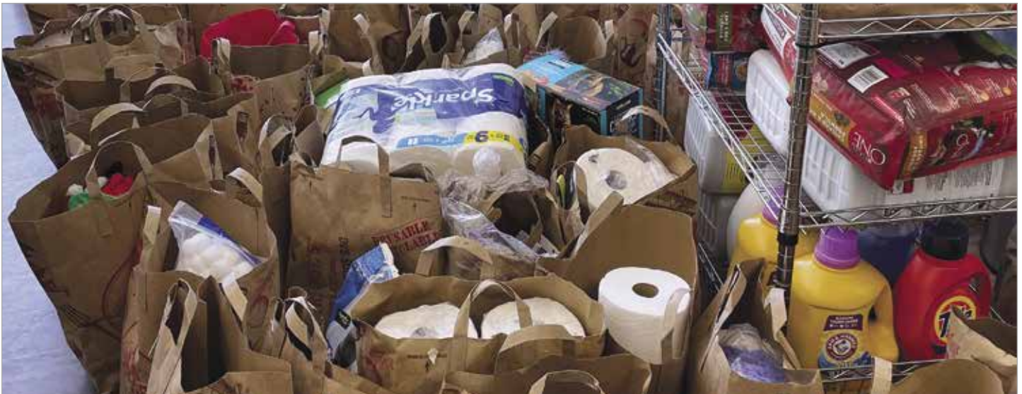
Arbor View Girl Scouts