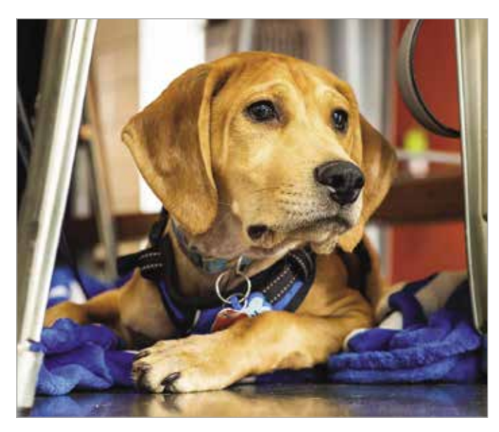
A pup sits patiently while his parents enjoy refreshments at Alter Brewing during Dog Days!

We also were fortunate to benefit from some amazing events hosted by others on our behalf, such as Dogs Days at Alter Brewing, Pictures with Santa at Two Bostons in Burr Ridge, and many others!