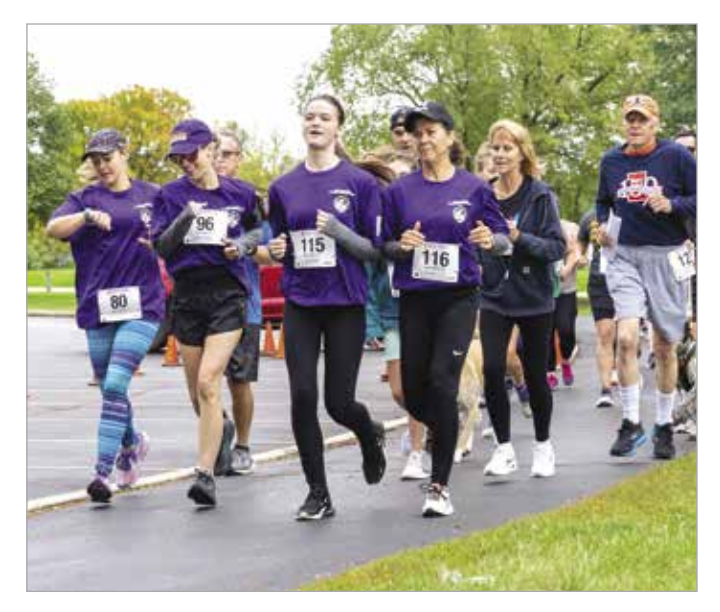
Runners take off at our first Annual 5K, as part of Barkapalooza!

2022 saw a return to in-person events, allowing us more opportunities to showcase our animals and bring the community closer to our mission. In addition to our traditional events, such as Trivia Night and our Plant Sale, we added a 5K to Barkapalooza, held our first Golf Outing, and created an on-site experience at our Adoption Center to our annual Pawction.