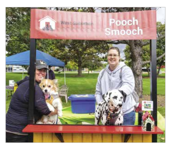
Our "Pooch Smooch" booth is always a fan favorite at Barkapalooza!