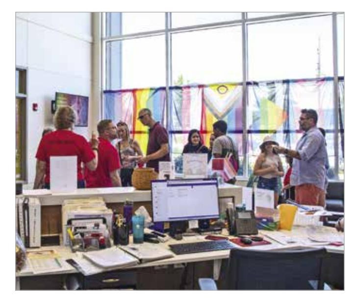
Volunteers and guests mingle at our first ever PURRide event.